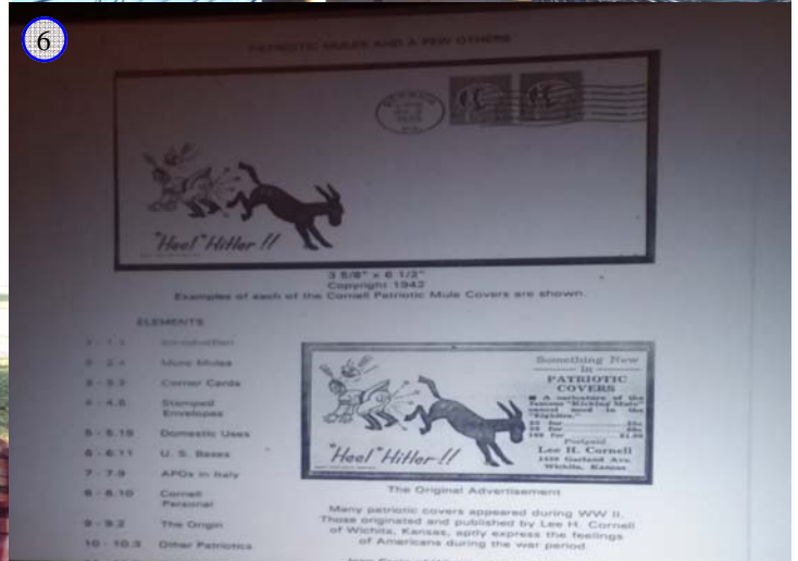
Figure 6. After everyone filled up at the picnic, we all came inside for a presentation on WWII Patriotic Covers given by Jim Myers. All in all, I would call it a great afternoon and evening's entertainment.