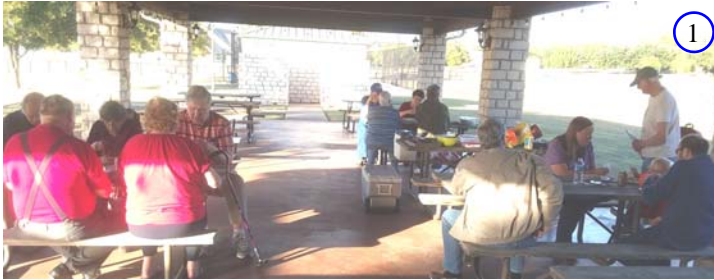
Figure 1. As I said, it was a beautiful day in Granbury and the Bentwater Activities Center is the perfect place for an outdoor gathering.

On October 22, the Mid Cities Stamp Club held a picnic at the Bentwater Activities Center in Granbury. It turned out to be a beautiful day to spend at the lake and all who attended had a great time. It was a lot of fun to catch up on the latest gossip and some people even talked among themselves about philately....go figure. Anyway, we managed to capture a few pictures to tell the story and they are included here: