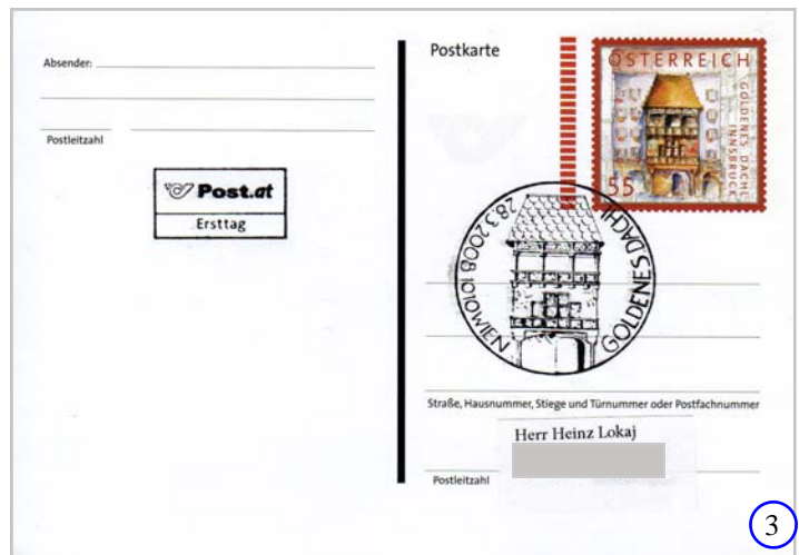
Issued 2015