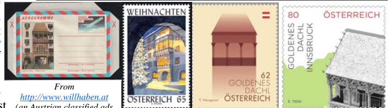
From http://www.willhaben.at (an Austrian classified ads website)