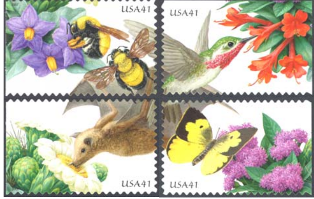
providing the images used in this article and for providing a wonderful exhibit in their promotion of our hobby.

Much thanks to the Smithsonian Institute's National Postal Museum for