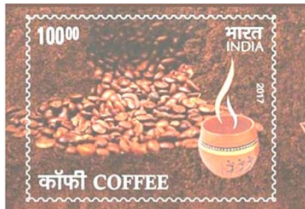
2017 Coffee scented stamp from India

As they say in the real estate business: "location, location, location". In the summer of 2013, we visited Switzerland and did a brief day-hike to scenic Sertig Dörfli (a small village at the end of the Sertig valley near Davos). Looking at THAT view on a beautiful day and enjoying a great cup of Swiss coffee ... I mean, what could be better? ... Sigh ... wish I could be there now!